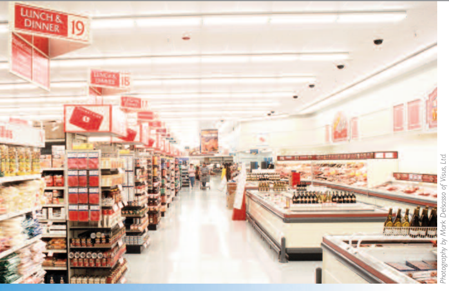
Ideal for applications where longer relamp cycles would be beneficial

Environmentally Responsible Lamps: Long Life and Low Mercury